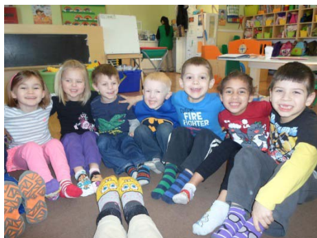
Silly Sock Day!