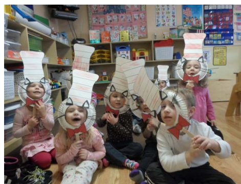
We made "The Cat in the Hat"