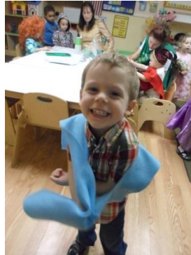
Sir Connor, the brave and fearless Knight.