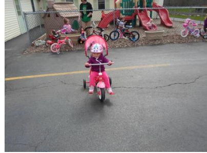
The kids had a fun time riding their bikes for a good cause!