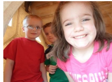
Releasing our Butterflies and having fun in the sun!