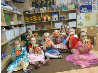
Pre K 3 made fire breathing dragons during their Fairy Tale Party!